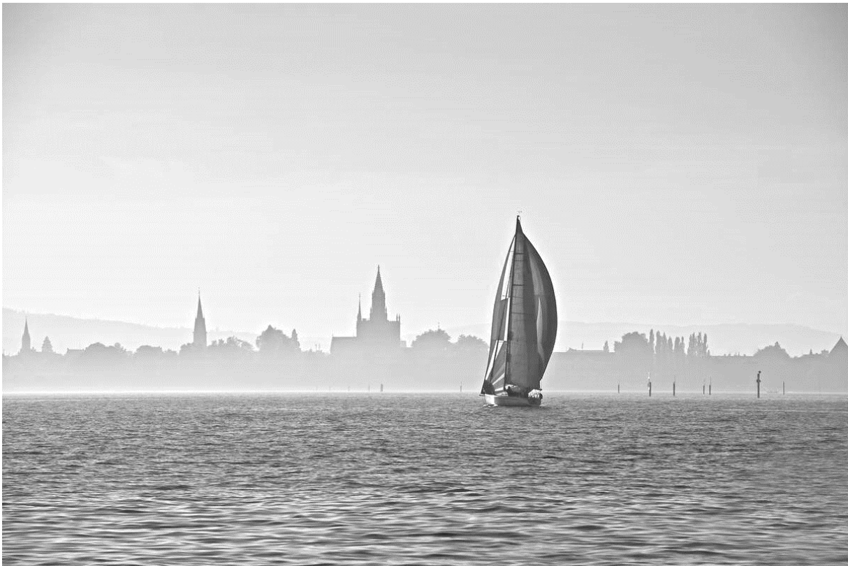
Workshop in Konstanz, Germany